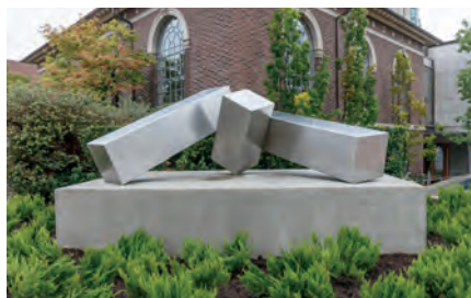
Kosso Eloul, Shlosha , 1974 Collection of the MacLaren Art Centre. Gift of Beverley Zerafa and Boris Zerafa, 2001.